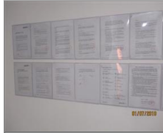
Photo of the code of conduct on display amfori BSCI COC.JPG