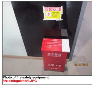
Photo of fire safety equipment fire extinguishers.JPG