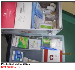
Photo first aid facilities first aid kit.JPG