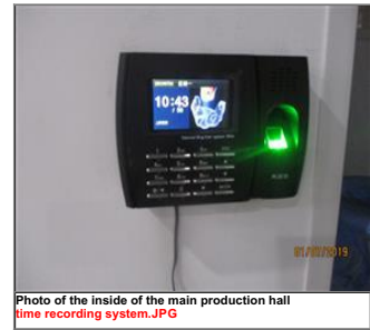
Photo of the inside of the main production hall time recording system.JPG