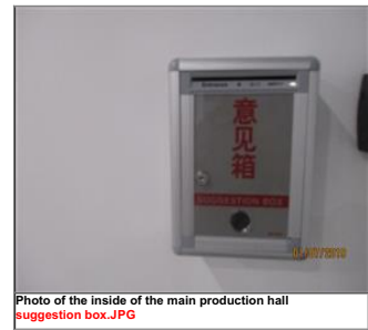
Photo of the inside of the main production hall suggestion box.JPG