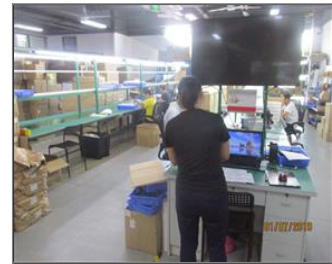
Photo of the inside of the main production hall assembly and packing section.JPG