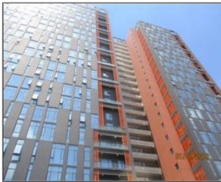
External photo(s) of the production unit(s) factory building.JPG