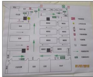
Photo of fire safety equipment evacuation plot plan.JPG