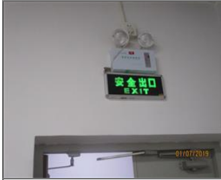
Photo of fire safety equipment emergency light and exit sign.JPG