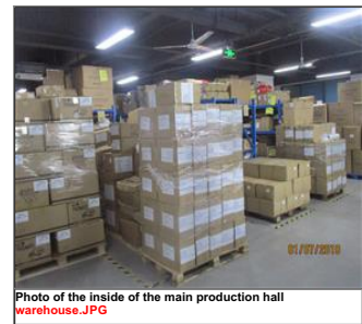
Photo of the inside of the main production hall warehouse.JPG