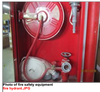
Photo of fire safety equipment fire hydrant.JPG