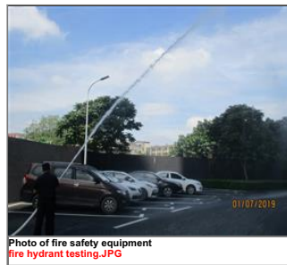
Photo of fire safety equipment fire hydrant testing.JPG