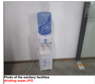
Photo of the sanitary facilities drinking water.JPG