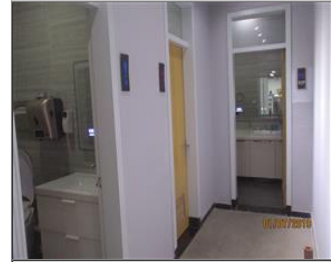
Photo of the sanitary facilities toilet.JPG