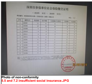
Photo of non-conformity 5.5 and 7.2 insufficient social insurance.JPG